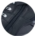
Internal side zip